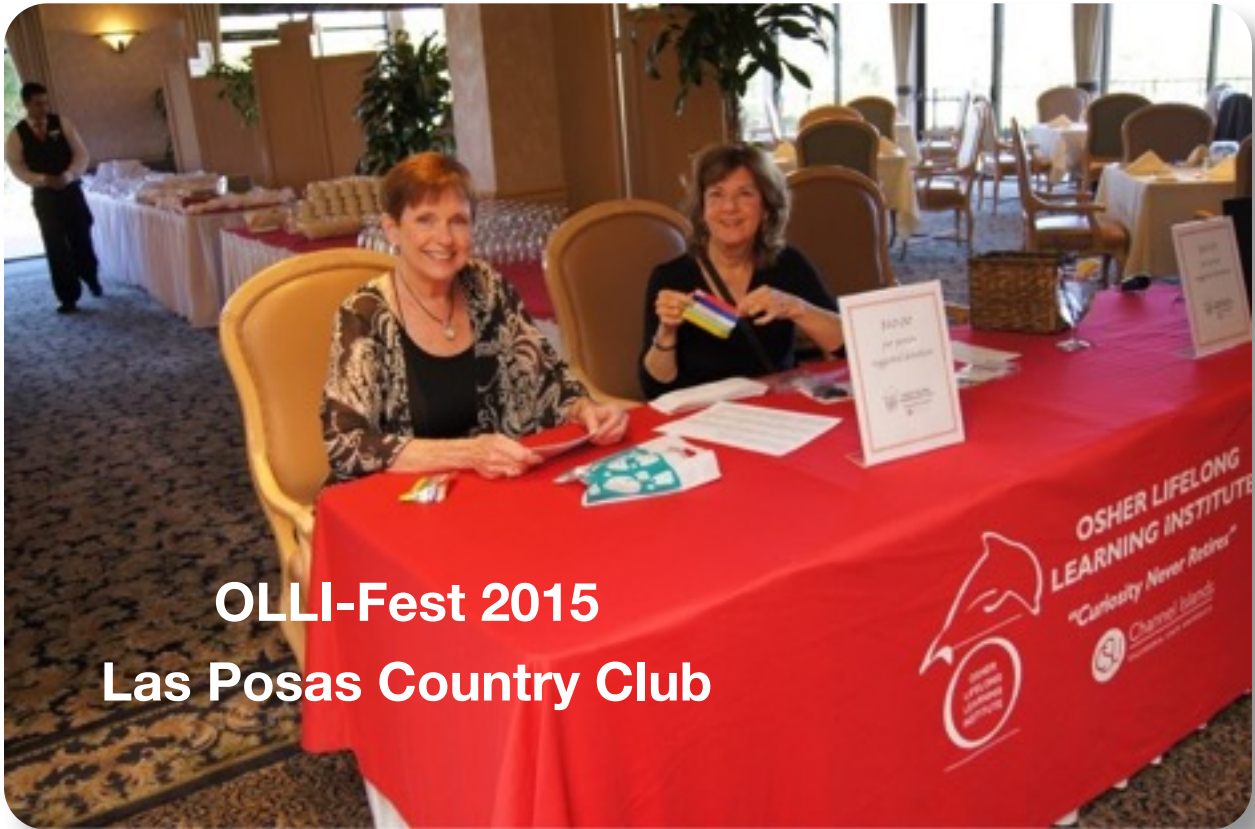
OLLI-Fest 2015 Las Posas Country Club