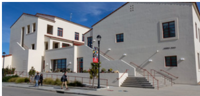
California State University Channel Islands Computer Lab, Sierra Hall #1212 One University Dr, Camarillo, CA 93012