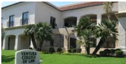
The College of Law - Ventura Campus (COLV) 4475 Market St, Ventura, CA 93003