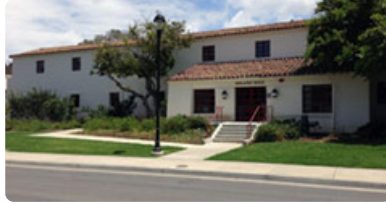
California State University Channel Islands FIT Studio, Solano Hall #1201 One University Dr, Camarillo, CA 93012