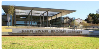
California State University Channel Islands John Spoor Broome Library Room # 2325 One University Dr, Camarillo, CA 93012