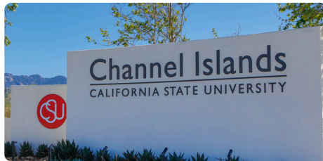
California State University Channel Islands (CSUCI) One University Dr, Camarillo, CA 93012