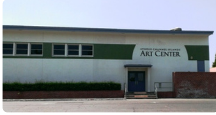
Studio Channel Islands Art Center (SCIART) Blackboard Gallery 2222 E. Ventura Blvd, Camarillo, CA 93010