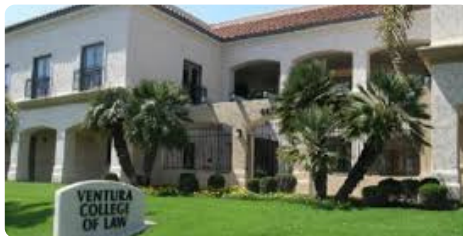
The College of Law - Ventura Campus (COLV) 4475 Market St, Ventura, CA 93003