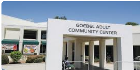
Goebel Adult Community Center (GACC) 1385 E Janss Rd, Thousand Oaks, CA 91362