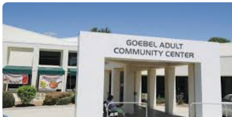
Goebel Adult Community Center (GACC) 1385 E Janss Rd, Thousand Oaks, CA 91362