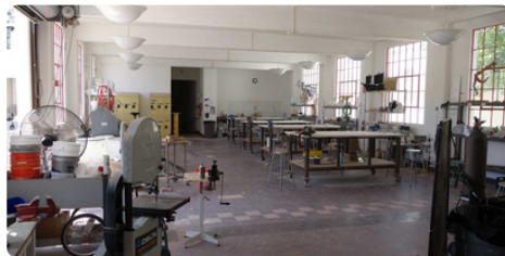
California State University Channel Islands (CSUCI) Ceramics Studio Topanga Hall #1994 One University Dr, Camarillo, CA 93012