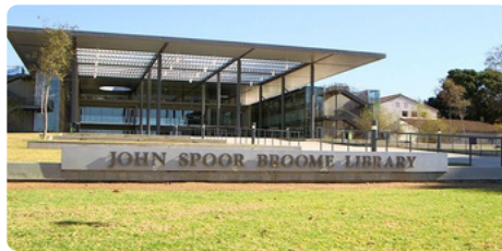
California State University Channel Islands (CSUCI) John Spoor Broome Library Room # 2325 One University Dr, Camarillo, CA 93012