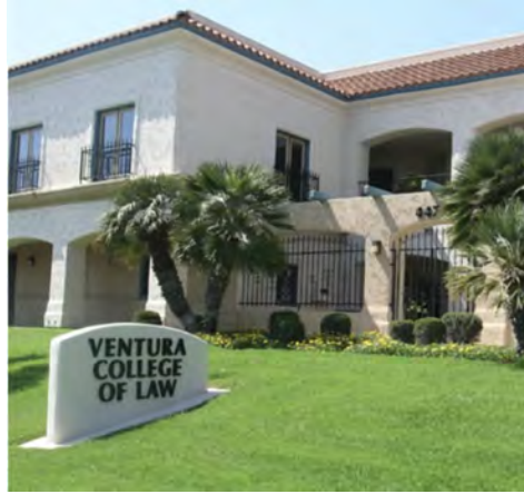
The College of Law - Ventura Campus (COLV) 4475 Market St Ventura, CA 93003