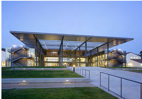
California State University Channel Islands John Spoor Broome Library Room # 2325 One University Dr Camarillo, CA 93012