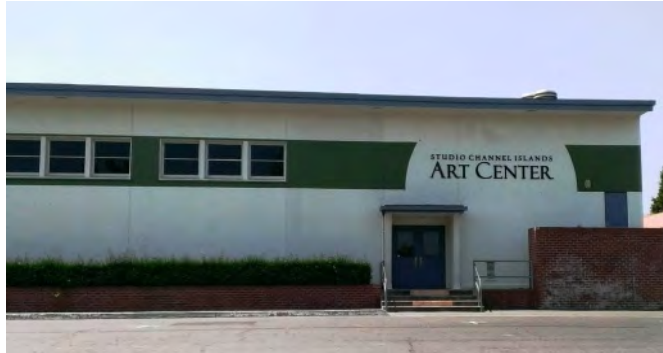
Studio Channel Islands Art Center (SCIART) at the Blackboard Gallery 2222 E. Ventura Blvd, Camarillo, CA 93010