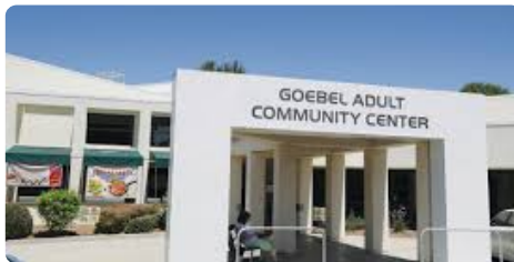
Goebel Adult Community Center (GACC) 1385 E Janss Rd, Thousand Oaks, CA 91362