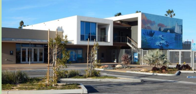
Picture of the Channel Islands Boating Center