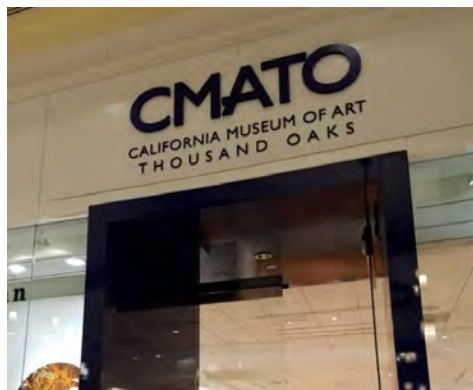
California Museum of Art Thousand Oaks (CMATO) 350 West Hillcrest Drive Oaks Mall 2nd Level, Thousand Oaks, CA 91360