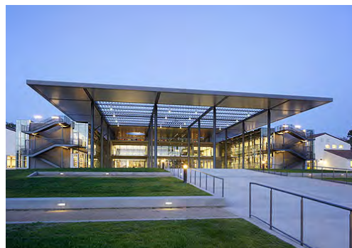
California State University Channel Islands John Spoor Broome Library One University Dr Camarillo, CA 93012