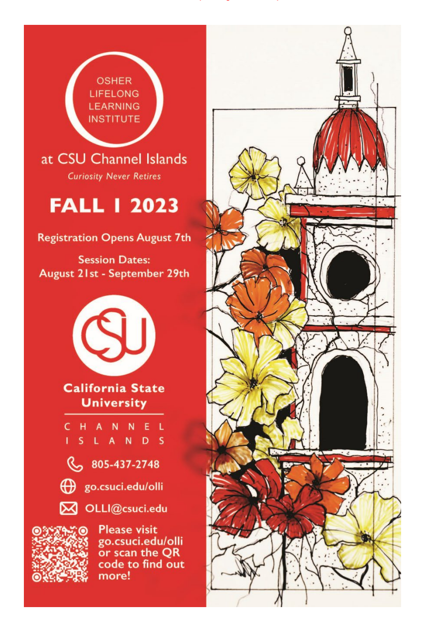
The Fall I OLLI session is now open for registration! Classes will begin on Monday, August 21<sup>st</sup>. Exciting course topics include literature, art, science, music, and more! The catalog can be found on our website and here: <u>Fall I Catalog</u>. Registration for the Fall I session can be found here: <u>Fall I Registration</u>.