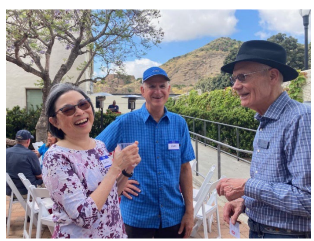
OLLI Members visit the Land of Fire and Ice