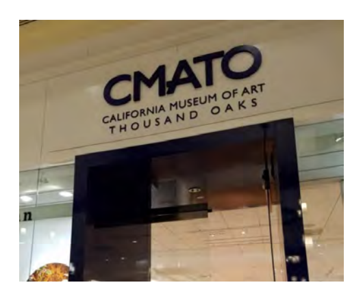
California Museum Of Art Thousand Oaks (CMATO) 350 West Hillcrest Drive Oaks Mall 2nd Level, Thousand Oaks, CA 91360